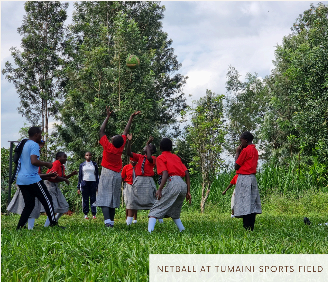
NETBALL AT TUMAINI SPORTS FIELD

The school children have sports every Friday afternoon. Our school field is about a quarter mile from the school compound.