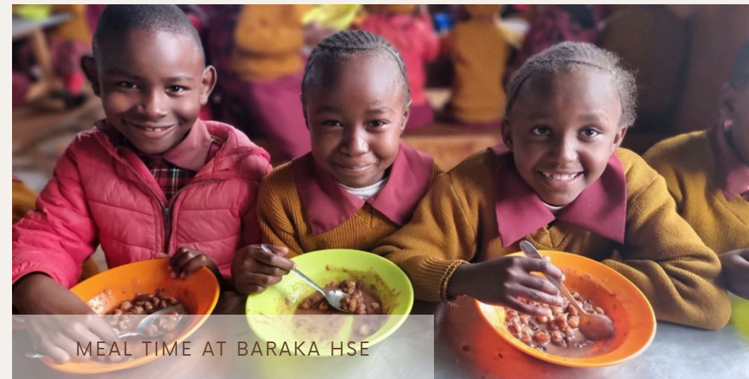
MEAL TIME AT BARAKA HSE