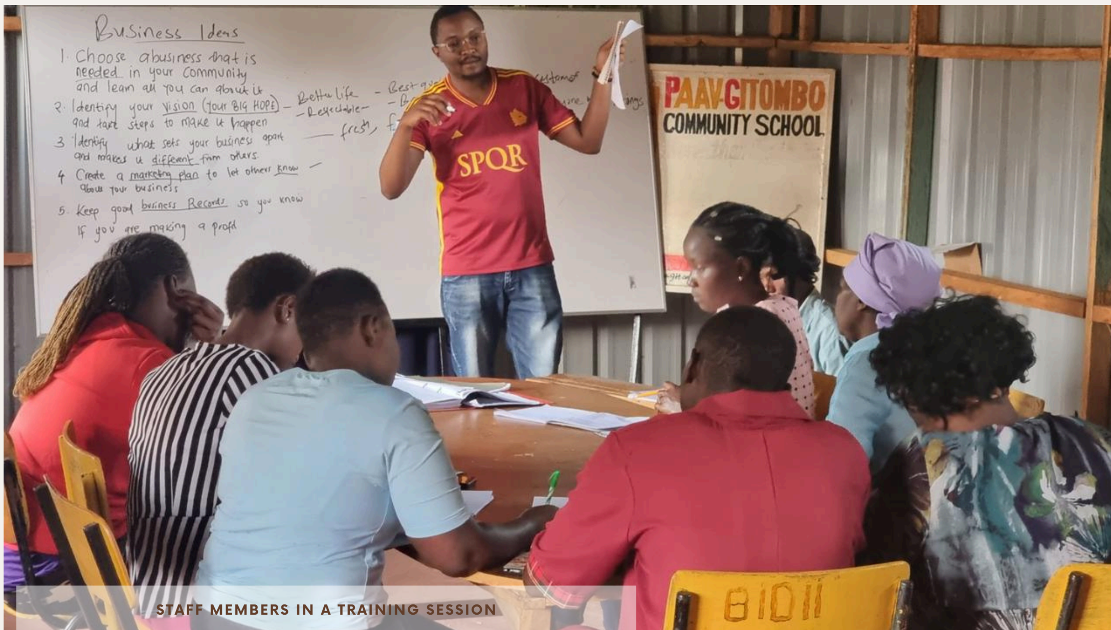
STAFF MEMBERS IN A TRAINING SESSION