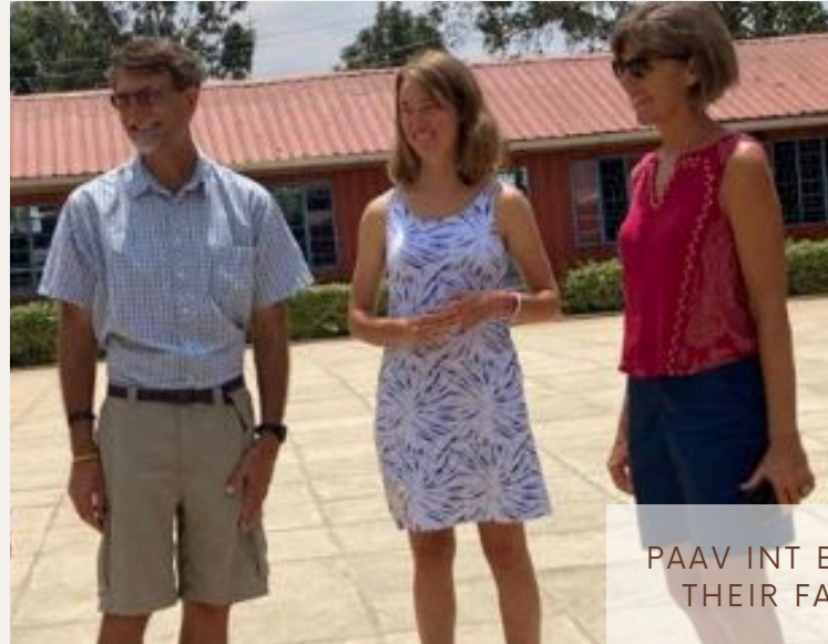
PAAV INT BOARD MEMBERS WITH THEIR FAMILIES IN GITOMBO