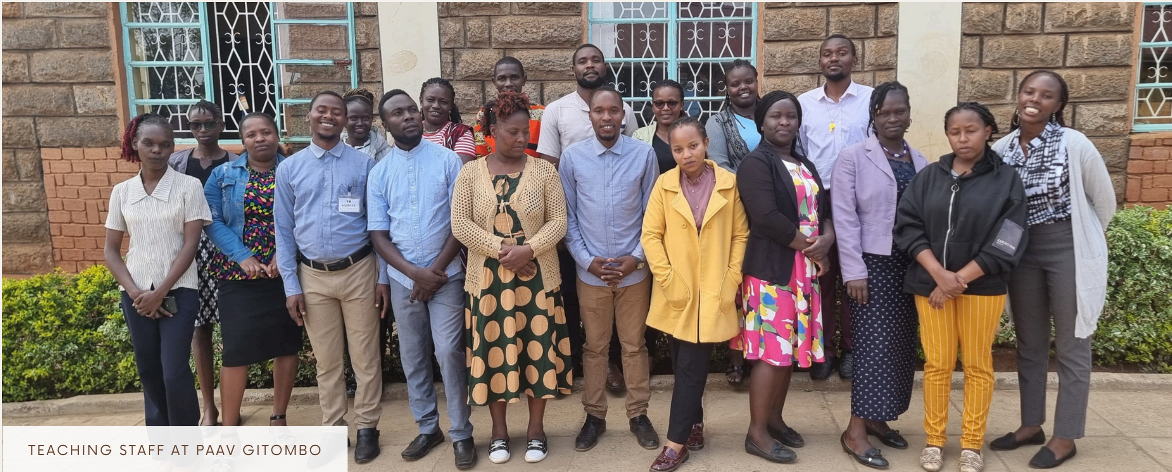
TEACHING STAFF AT PAAV GITOMBO

Most of the teachers are from all over Kenya and are graduates of various Colleges and Universities.