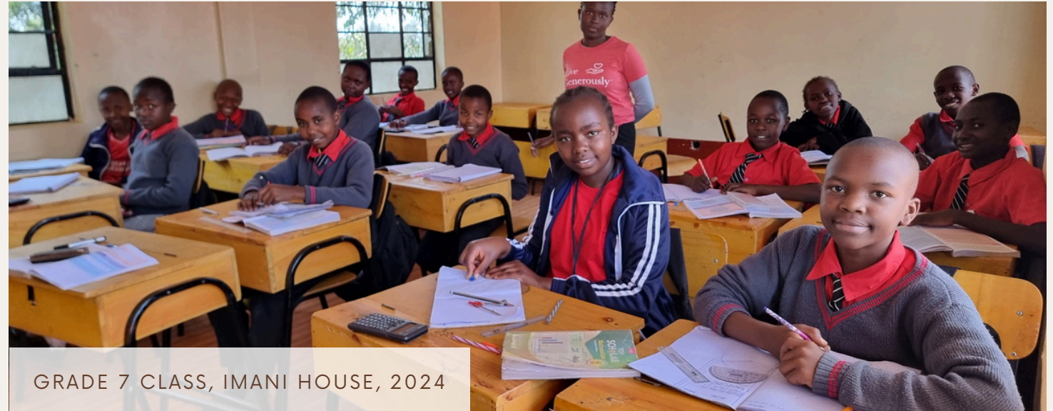
GRADE 7 CLASS, IMANI HOUSE, 2024

Over the weekends, we provide Sunday School for the children, Bible Study for the youth and Pillars parents, and Saturday Sports to the community children.