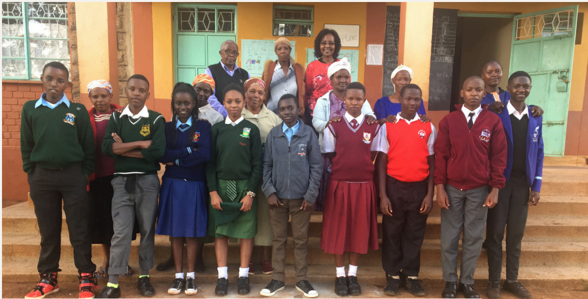
SPONSORED CHILDREN WITH THEIR PARENTS, 2018

They formed a Bible study and Fellowship Group called Youth With a Difference (YWAD). They are key role models to our children at school.