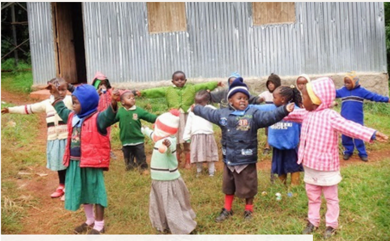
FIRST LEARNERS 2014