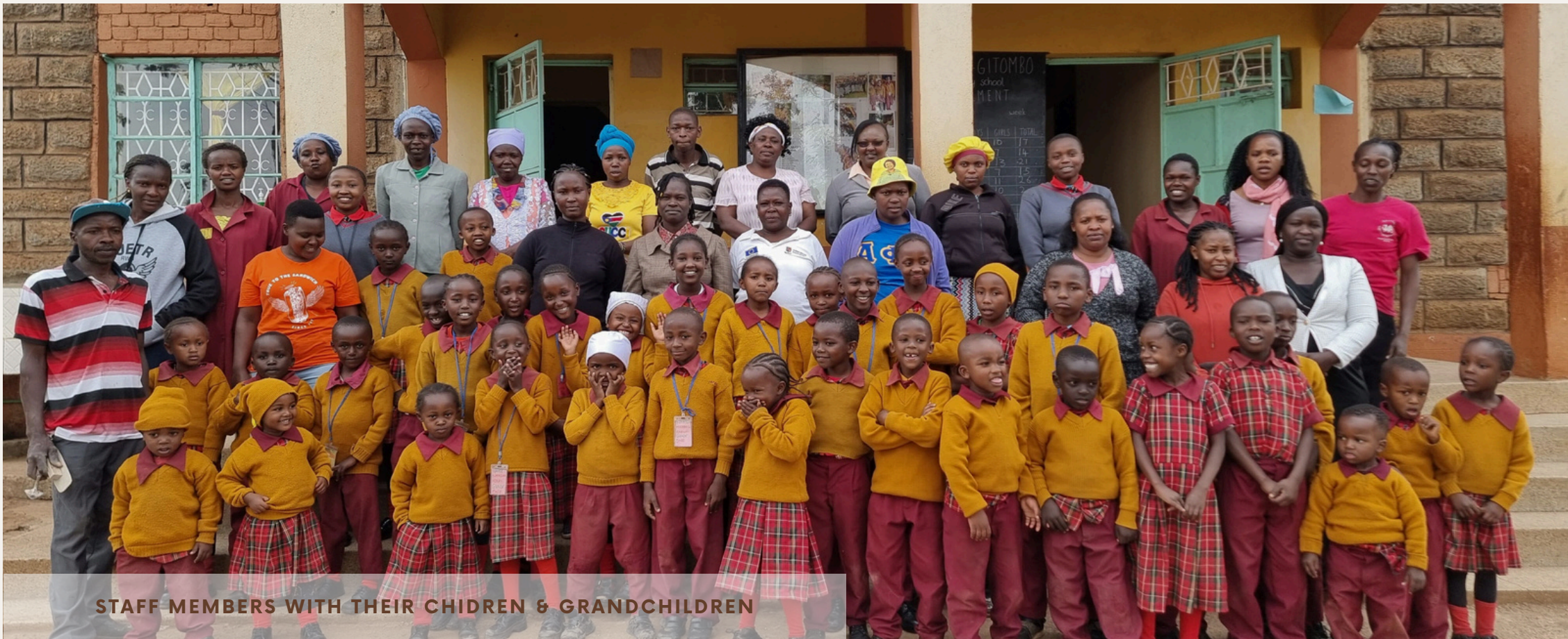
STAFF MEMBERS WITH THEIR CHILDREN & GRANDCHILDREN

Almost all the non-teaching staff are from the community. A majority of them are parents at school. Therefore, being employed at PAAV provides them with the honor of educating their children and thereby transforming their families. Doing Bible study and other training provided at the school has made a huge difference in their lives.