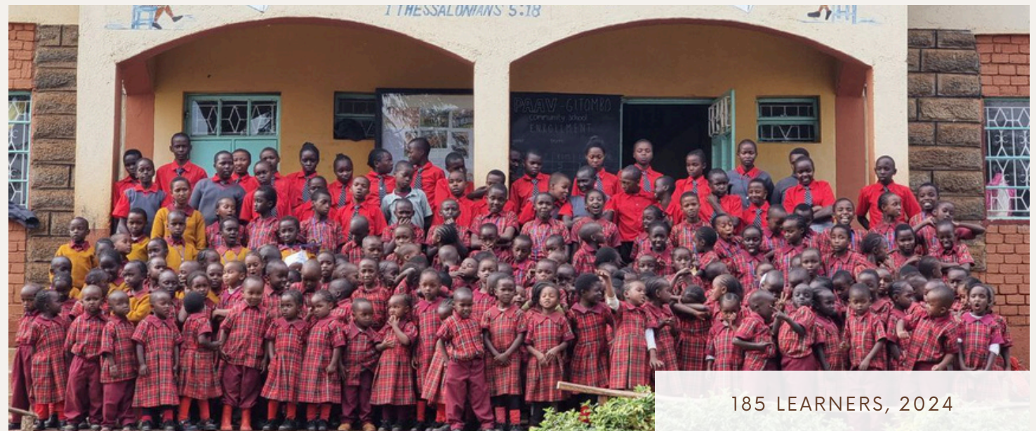
185 LEARNERS, 2024