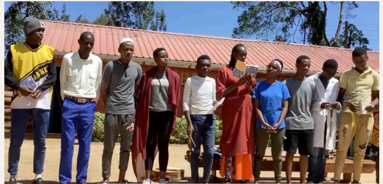
YWAD BIBLE STUDY GROUP, 2024