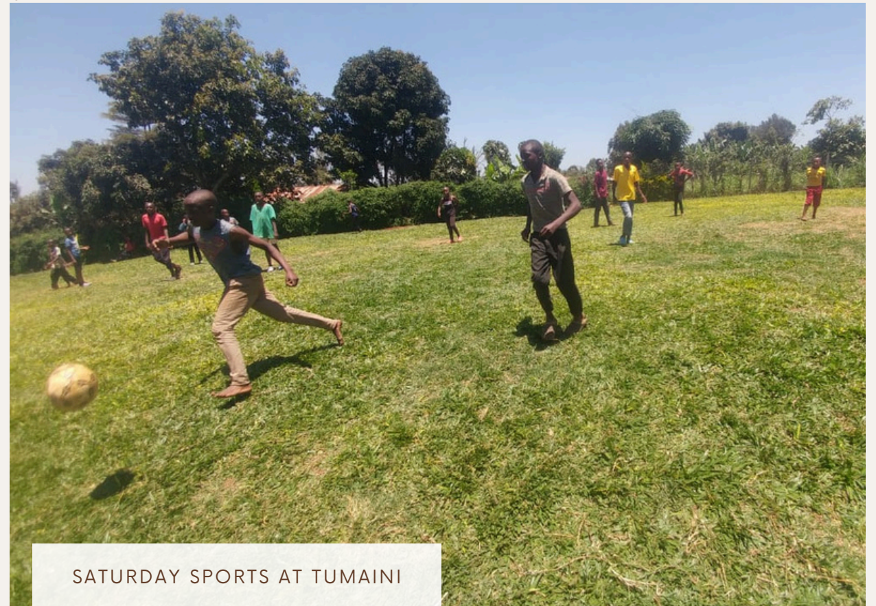
SATURDAY SPORTS AT TUMAINI

On Saturdays, the school children and the community children come together for sports on the school field. This is a wonderful opportunity for the community children who would otherwise be playing on the road. This is unsafe but there was no other field in Gitombo. They play football and volleyball after which a teacher leads them in Scripture, a Hymn and Prayer