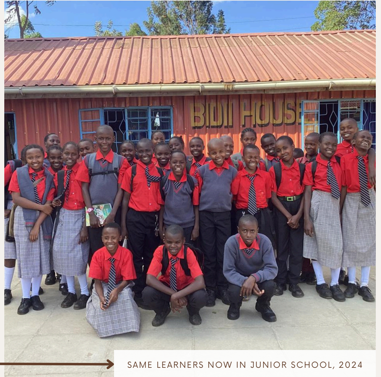
SAME LEARNERS NOW IN JUNIOR SCHOOL, 2024