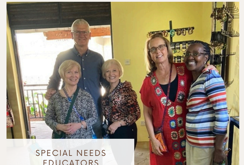
SPECIAL NEEDS EDUCATORS