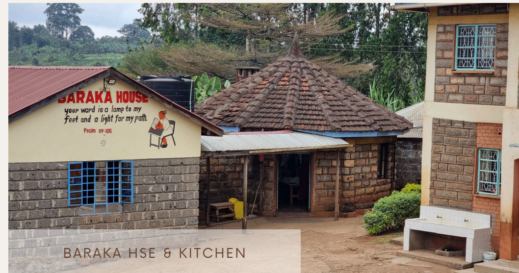
BARAKA HSE & KITCHEN

Baraka House has been a blessing for all the children by giving them a new dining experience where they eat at the table and acquire social skills, through eating and praying together as a family.